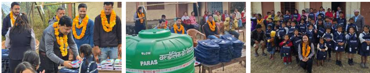
Mangsir 10, 2082 | Region 1 reached Shree Primary School, Danabari, Dharan to distribute school bags including stationary items for students and installed a water tank for the provision of drinking water.