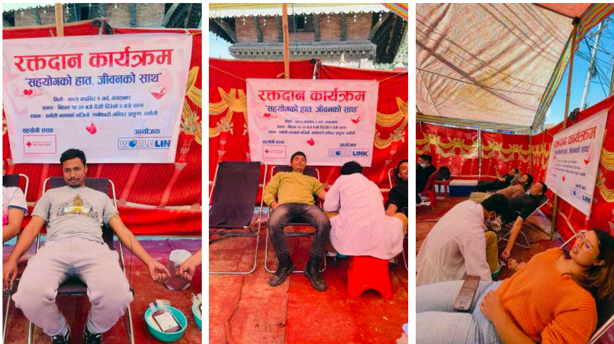
Mangsir 2, 2082 | Region 3 a blood donation program was successfully held at Maaneshwori Temple premises (Banepa and Panauti bus park) where 25 units of blood were collected with the support of generous volunteers.